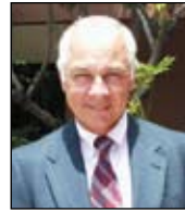
Jim Walker Bungalow Restaurant