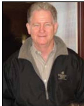
Newport Floor Covering 3500 E. Coast Hwy. Corona del Mar (949) 675-1636 (See back cover for more info)