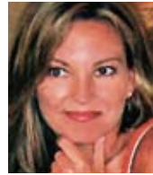
President Linda Leonhard Chamber